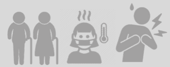
The highest numbers of deaths occurs among elderly and people with pre-existing medical conditions.

Accurate and complete sex-disaggregated data is needed including to support knowledge on age differentials as the severity of infection is associated with age (60+ years) and underlying conditions. It is important to pay key attention to the needs of older women in light of lessons from other infectious diseases, i.e. HIV, where the infection rates among older adults - primarily women - has been a neglected area of focus and by extension a neglected area of the response.